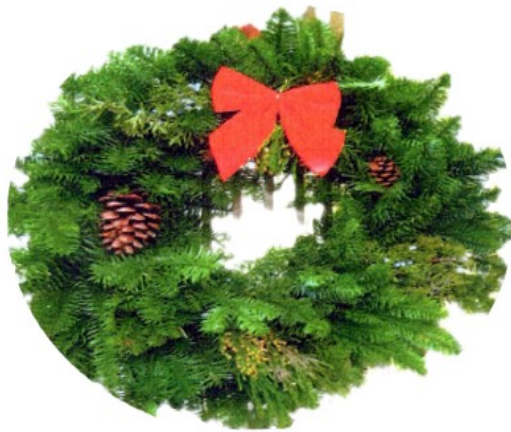
Christmas Wreaths $25.00