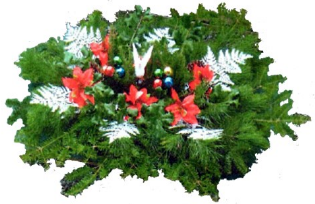
Grave Blankets $50.00

Please support our annual wreath & grave blanket sale. Same size & quality you have come to expect.