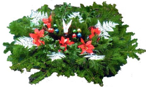
Grave Blankets $50.00

Please support our annual wreath & grave blanket sale. Same size & quality you have come to expect.